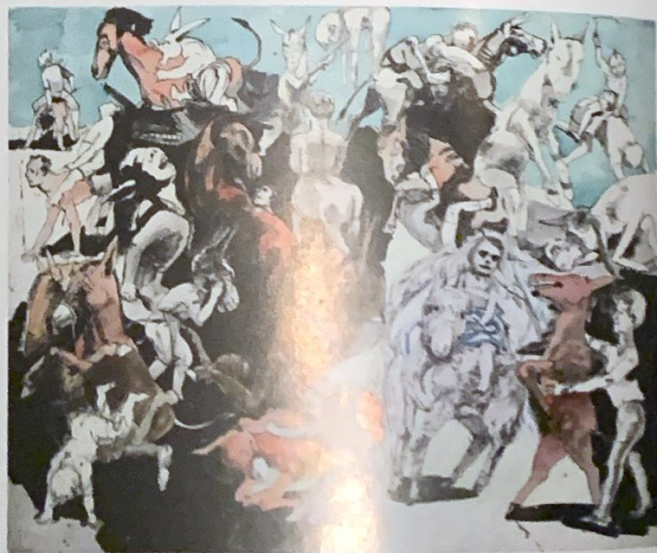
Island of the Lights from Pinoch by Paula Rego (b.1935). 1996. Pencil, ink and watercolour on paper, 100 by 180 cm. PIANO NOBILE, LONDON

For more information visit www.masterpiecefair.com