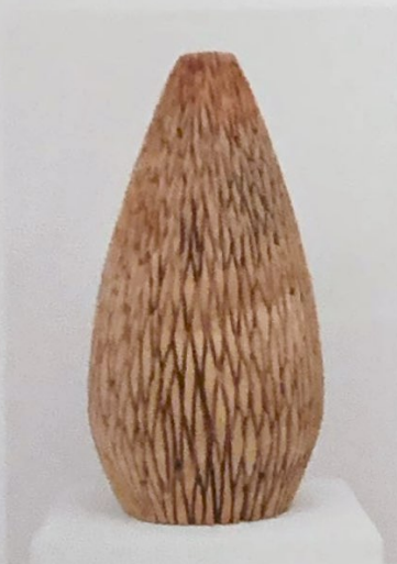
Diamond cut egg , by David Nash (b.1945). 2020. Maple, 71 by 30 by 30 cm. ANNELY JUDA FINE ART, LONDON