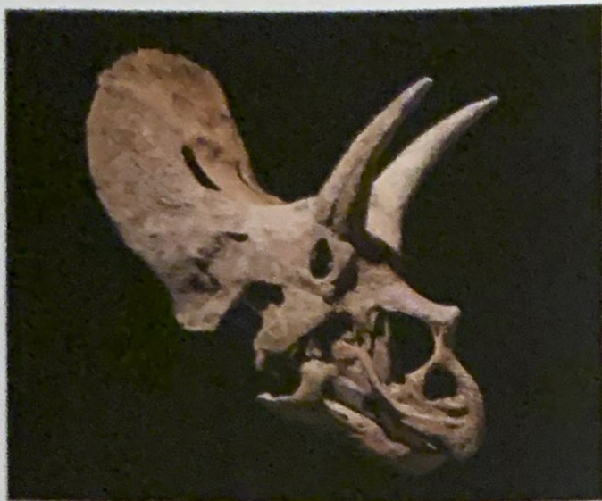
Skull of a Triceratops prorsus . Late Cretaceous period. Fossil, 170 by 115 by 150 cm. DAVID AARON, LONDON

South Grounds, The Royal Hospital Chelsea, London SW3 www.masterpiecefair.com